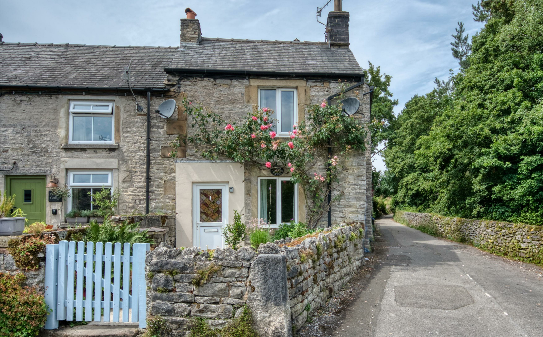
Corner Cottage, Michlow Lane, Smalldale, Bradwell, Hope Valley,